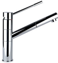
Mixer Tap Lorenzo 8466 000